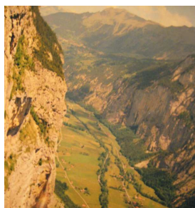
Foto taken by Oliver (while being in grad school) from his Paraglider near Lauterbrunnen in Switzerland.

1 A paraglider starts a flight in the mountain. The velocity is given in the above graph. Find out, whether the paraglider lands lower or higher than where it started.